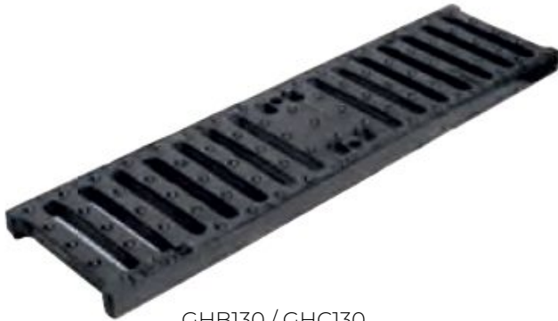
GHB130 / GHC130