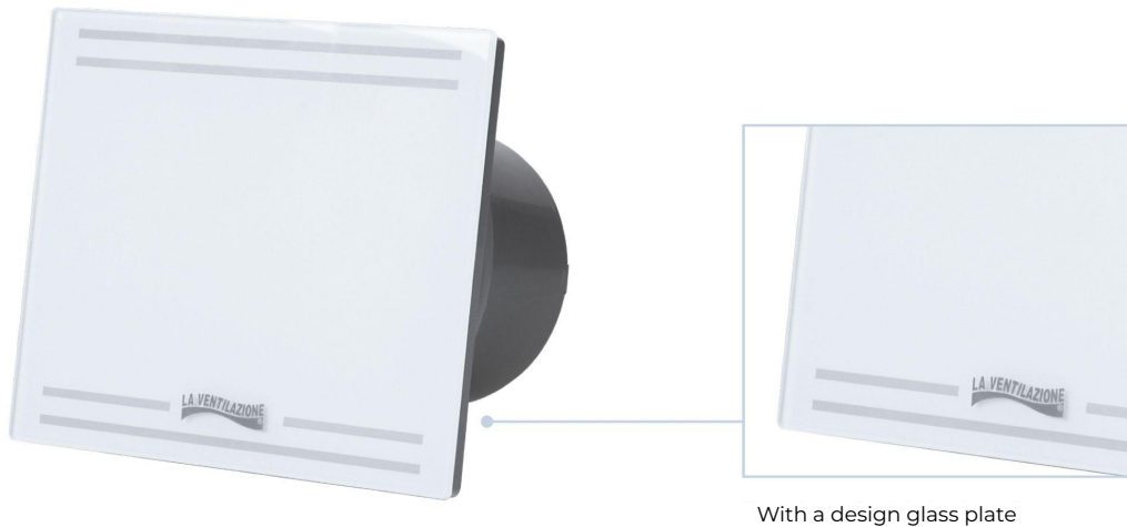
With a design glass plate